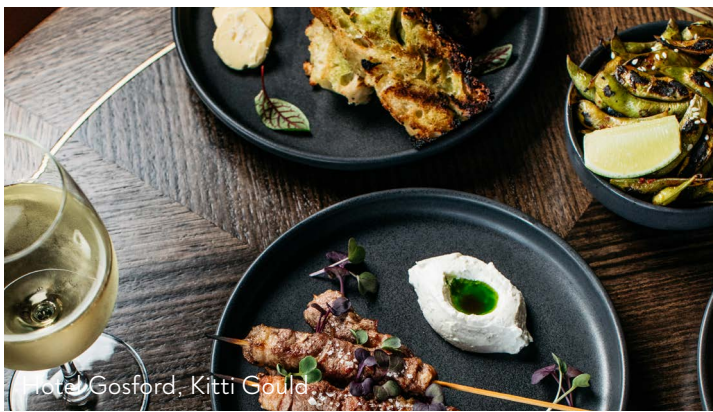
Hotel Gosford, Kitti Gould