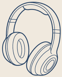
Noise cancelling headphones