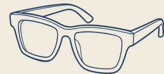
Hat, sunglasses and sunscreen