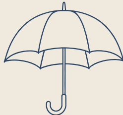
Wet weather clothing