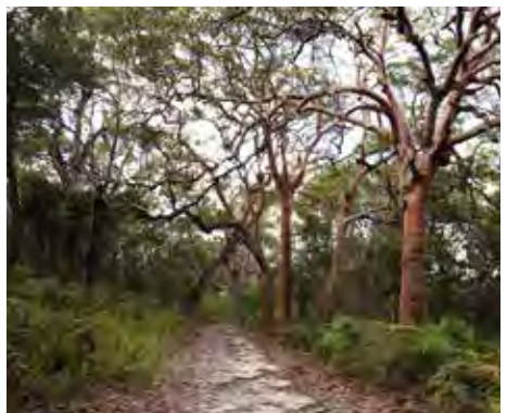
Image A firm, level dirt path is surrounded by tall Angophora trees and forest undergrowth.