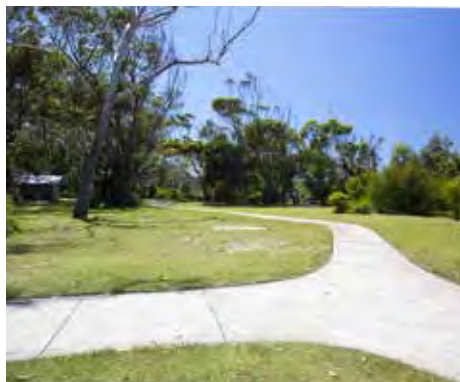
Image A shared concrete path within a flat grassed area provides easy access to toilet and picnic area.

Image A park bench on flat, firm grass faces a safety railing with a view over Bateau Bay Beach.