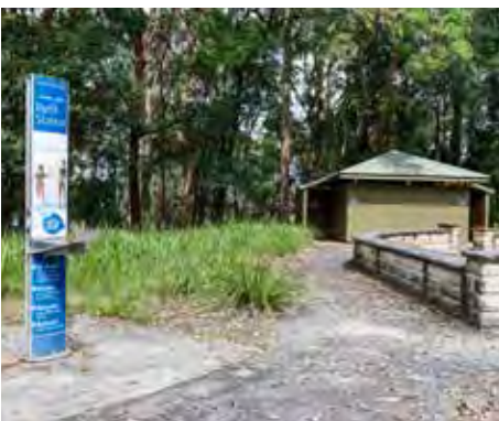
Image A level sandstone path provides access from parking to a water refill station and toilets.