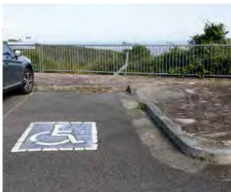
Image Accessible parking space with a kerbside ramp to access sandstone paving.