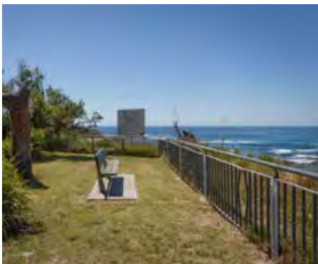
Image A park bench on flat, firm grass faces a safety railing with a view over Bateau Bay Beach.