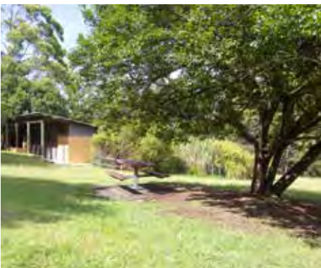
Image Accessible toilet block and picnic seating set on firm grass and under a shade tree.