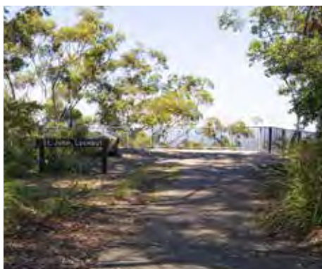
Image A wide, sandstone path with slight incline leads to a lookout with safety rail.