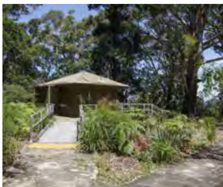
Image A flat sandstone path with Tactile Ground Surface Indicators (TGSI) leads to accessible toilets.

Image A wide, sandstone path with slight incline leads to a lookout with safety rail.