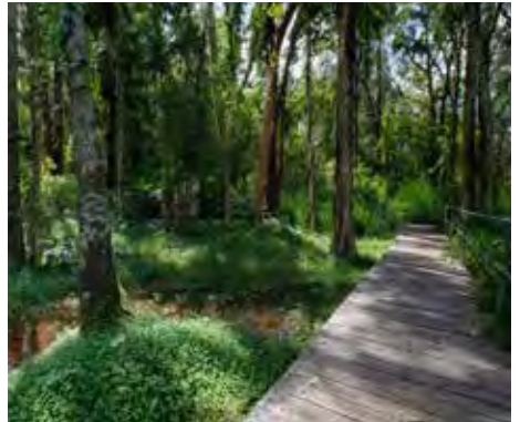
Image A flat, wooden boardwalk is edged by tall shade trees and flowering native plants.