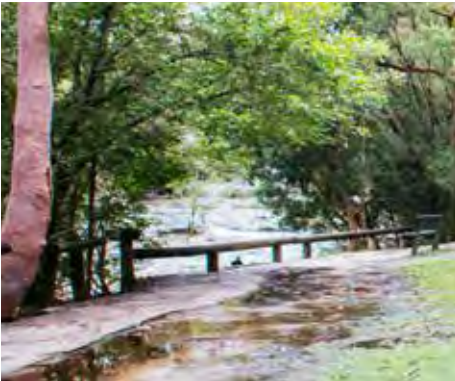
Image A flat sandstone paved area with seating, overlooking the top of Somersby Falls.