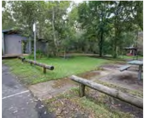
Image A shaded grass area with toilets, a BBQ and table accessed via concrete and sandstone paths.