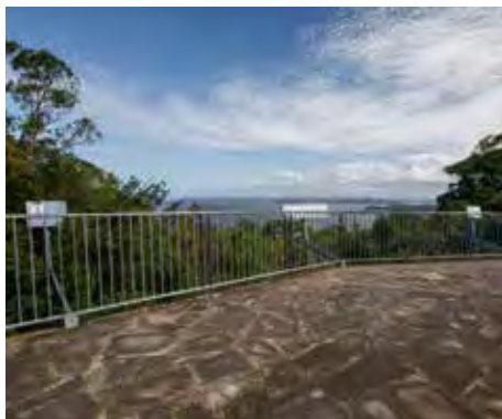
Image A lookout with views of the coastline to the southeast, information boards and safety rail.

Image Accessible parking space with a kerbside ramp to access sandstone paving.