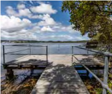
Image A view of water and mangrove ecosystems from a viewing platform.