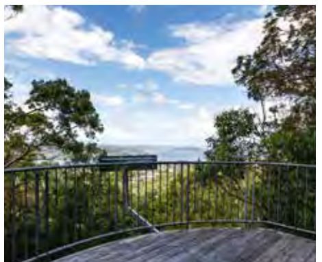
Image A suspended timber viewing platform with safety rail and views across Brisbane Water.