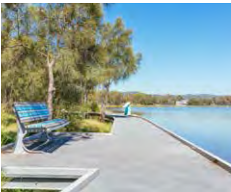
Image A park bench on the boardwalk faces Tuggerah Lake with wheelchair access either side.