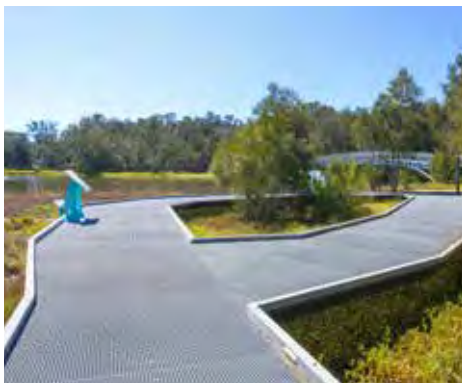
Image A wide, looped boardwalk with accessible signage. A bridge and water are in the background.

Image A park bench on the boardwalk faces Tuggerah Lake with wheelchair access either side.