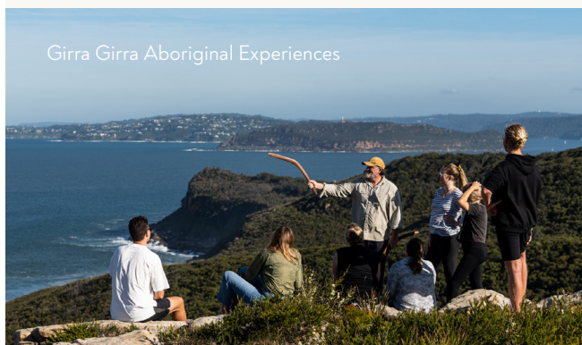
Girri Girra Aboriginal Experiences

Tap into the world's oldest living culture as you discover the midden sites, rock engravings and axe grinding grooves that are sacred to the traditional owners of the land of the Central Coast. Forage with Indigenous guides for bush fruits and flowers amongst the rainforests, billabongs and waterlily ponds at Fires Creek. Venture with specialist small group tour operator Girri Girra and experience culture and country for a renewed connection with the land, designed to encourage cultural awareness, critical thinking, and teamwork.