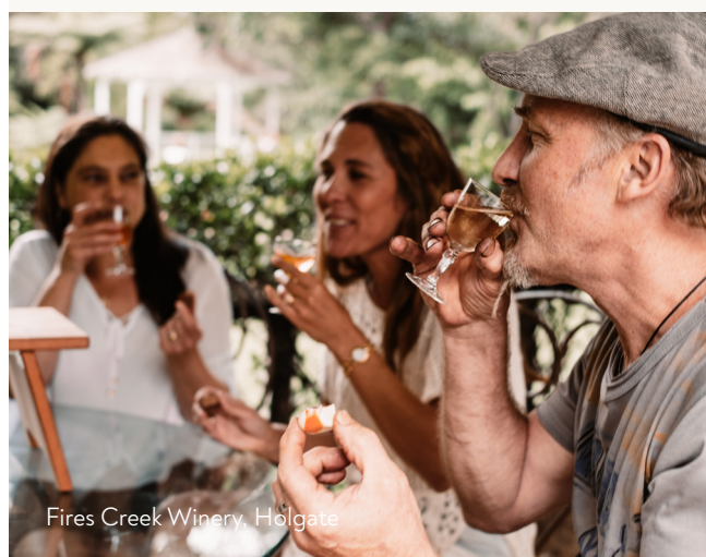
Fires Creek Winery, Holgate

To truly savour the flavours of the Central Coast, start at the source. Head to farm gates, cellar doors or one of the many markets to reap the rewards of the region's fertile grounds and marine culture. Meet the winemaker or take a chocolate and wine experience at Firescreek Fruit Wines . Meet oyster farmers and savour the freshest oysters on the Coast on a tour through Hawkesbury River Oyster Shed , or tempt your tastebuds with a cheese-making workshop, nougat and chocolates on the Meet the Maker Trail that takes you from coast to hinterland. Top it off with beachside dining, bars and cocktails at one of hundreds of small bars, craft distilleries and restaurants.