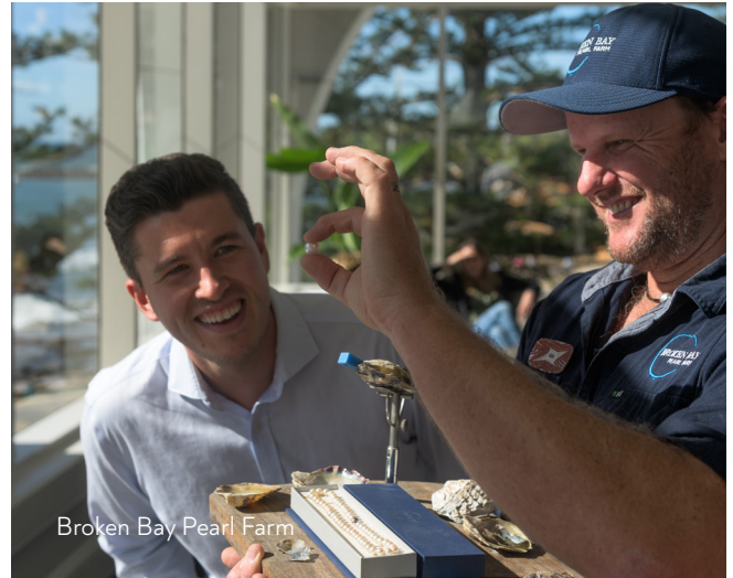
Broken Bay Pearl Farm