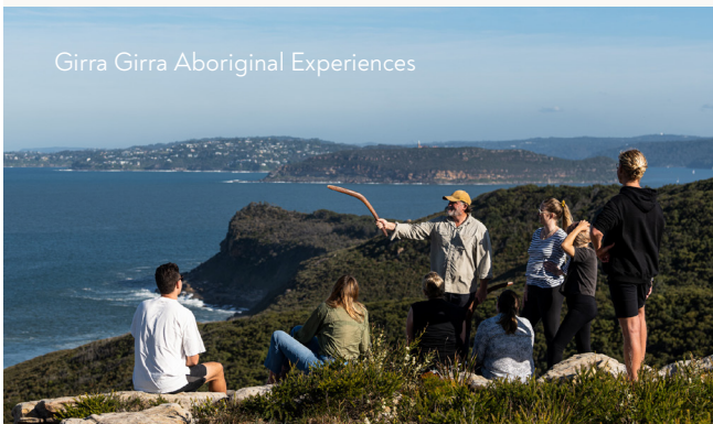
Girra Girra Aboriginal Experiences

Tap into the world's oldest living culture as you discover the midden sites, rock engravings and axe grinding grooves that are sacred to the traditional owners of the land of the Central Coast. Forage with Indigenous guides for bush fruits and flowers amongst the rainforests, billabongs and waterlily ponds at Fires Creek. Venture with specialist small group tour operator Girri Girra and experience culture and country for a renewed connection with the land, designed to encourage cultural awareness, critical thinking, and teamwork.