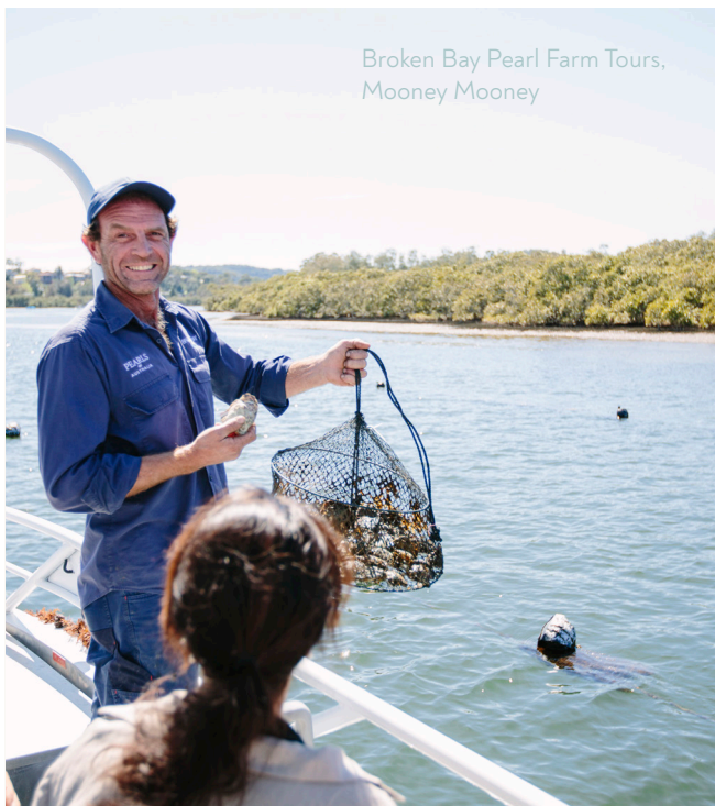
Broken Bay Pearl Farm Tours, Mooney Mooney