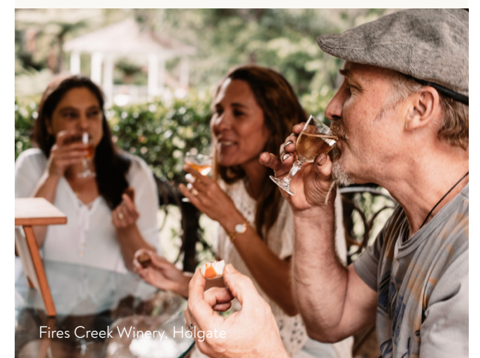
Fires Creek Winery, Holgate

To truly savour the flavours of the Central Coast, start at the source. Head to farm gates, cellar doors or one of the many markets to reap the rewards of the region's fertile grounds and marine culture. Meet the winemaker or take a chocolate and wine experience at Firescreek Fruit Wines . Meet oyster farmers and savour the freshest oysters on the Coast on a tour through Hawkesbury River Oyster Shed , or tempt your tastebuds with a cheese-making workshop, nougat and chocolates on the Meet the Maker Trail that takes you from coast to hinterland. Top it off with beachside dining, bars and cocktails at one of hundreds of small bars, craft distilleries and restaurants.