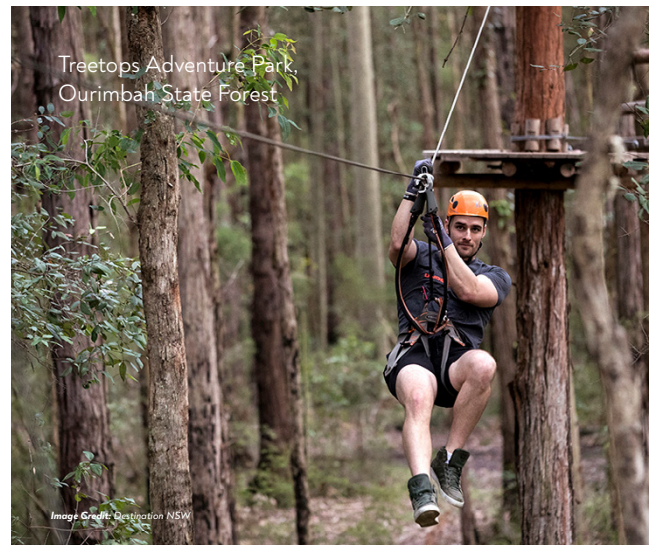
Treetops Adventure Park, Ourimbah State Forest