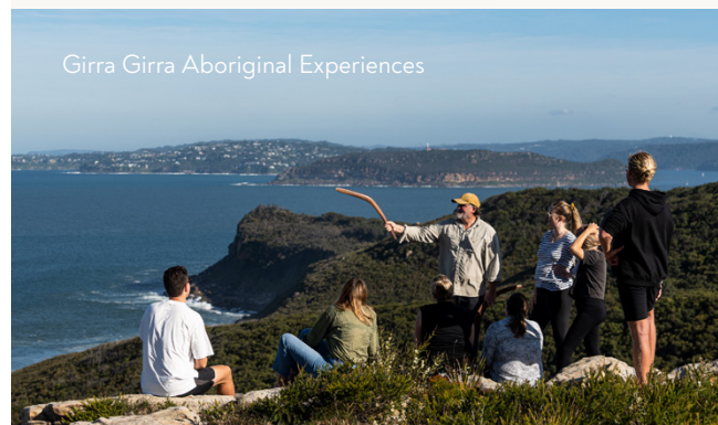
Girra Girra Aboriginal Experiences

Tap into the world's oldest living culture as you discover the midden sites, rock engravings and axe grinding grooves that are sacred to the traditional owners of the land of the Central Coast. Forage with Indigenous guides for bush fruits and flowers amongst the rainforests, billabongs and waterlily ponds at Fires Creek. Venture with specialist small group tour operator Girri Girra and experience culture and country for a renewed connection with the land, designed to encourage cultural awareness, critical thinking, and teamwork.