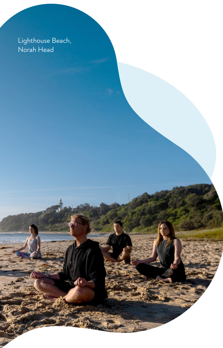
Lighthouse Beach, Norah Head

Along boundless coastlines and across rugged landscapes, the region has plenty to offer Business Events organisers looking to inspire, connect and reinvigorate their groups. Here are some of our recommended itineraries.